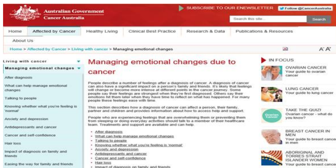
Figure 1: Health information about managing emotions due to cancer as presented in CancerAustralia.org.au